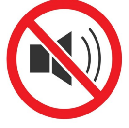
No Loud Music